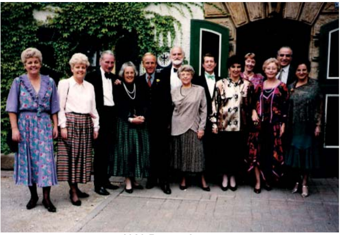
1989 Bayreuth group